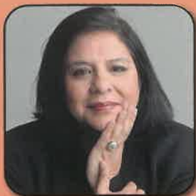
Consuelo Castillo Kickbusch