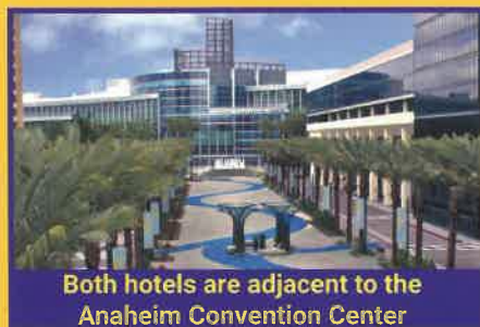
Both hotels are adjacent to the Anaheim Convention Center