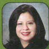
Consuelo Castillo Kickbusch