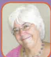
Alma Flor Ada