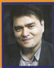
José Antonio Vargas Journalist and Filmmaker