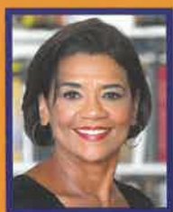
Sonia Manzano "Maria" from Sesame Street