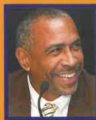
Pedro Noguera UCLA