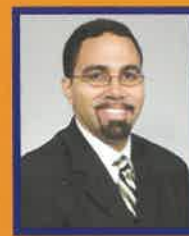
John B. King, Jr. U.S. Department of Education (Invited)