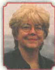
Alma Flor Ada