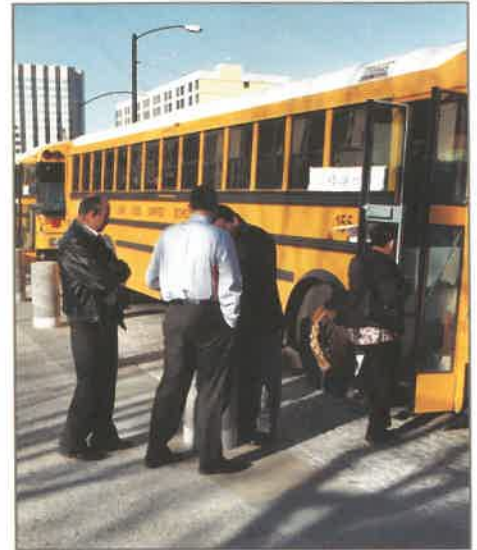
Exhibit Hall Opening

Be sure to visit exemplary programs for English Learners—e.g., Two-Way/Dual Language Immersion, ELD. Participants have an opportunity to see these programs in action. Buses depart from the San José McEnery Convention Center at 8:30 a.m. and return by 2:00 p.m. Please indicate participation and selection of school site (first and second choice—see descriptions of program types on insert page) for this event on the CABE 2008 Conference Registration Form in the appropriate section of this brochure. (Please note that there is a fee of $50 to participate.)