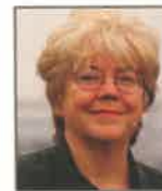
Alma Flor Ada Author, University of San Francisco

that he gained the cultural knowledge he now shares with children through his books and recordings.